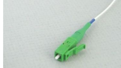
Single mode LC/UPC pigtail