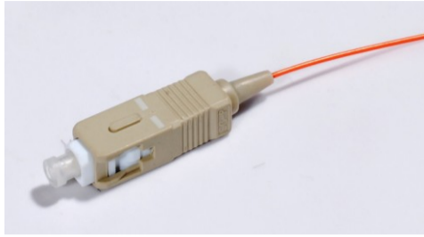
Multimode SC/UPC pigtail